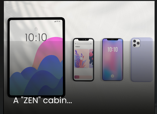
A "ZEN" cabin...