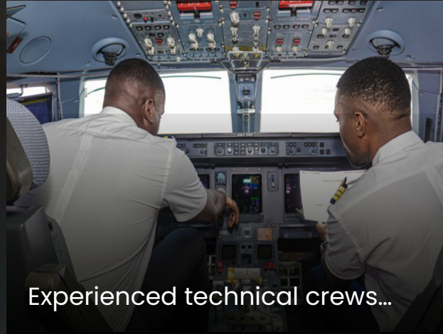
Experienced technical crews...

Dream together Dream big Dream Fly ZEJET